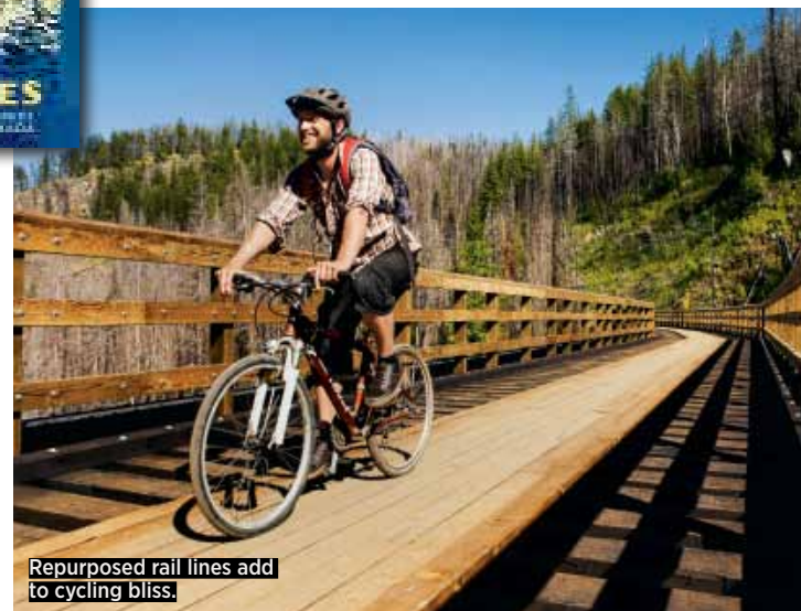
Repurposed rail lines add to cycling bliss.

HOODOO ADVENTURES leads kayak trips on Okanagan Lake (which, according to local lore, is inhabited by OGOGO , BC's tongue-in-cheek answer to the Loch Ness Monster). After an hour of paddling, a shuttle takes you to wineries along Naramata Bench for spectacular sips and vistas. At LA FRENZ WINERY , for example, you can admire the same view that graced the back of the Canadian $100 bill from 1954 to 1975.