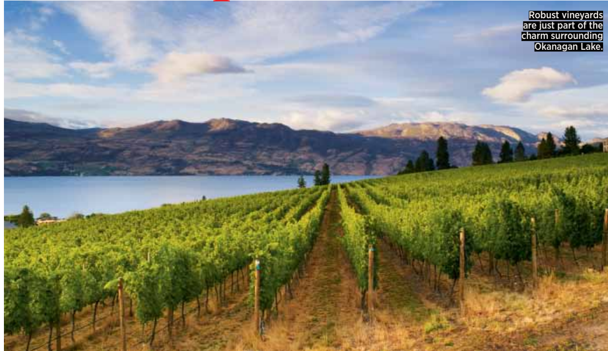
Robust vineyards are just part of the charm surrounding Okanagan Lake.